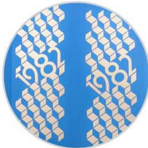
VISIBILITY Seripress Booth: 305 REFLECT HV DM146-3R