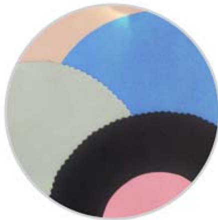
VISIBILITY 2nd Europe Booth: 431 3M™ Scotchlite™ Reflective Material - C177 series