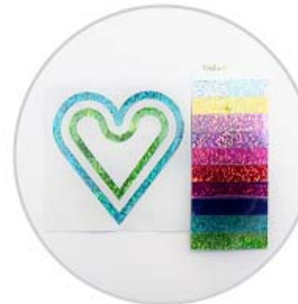
TRANSFER Regline iQzinn GmbH Booth: 194 i203 iQzooks glossytransfer GLITTER