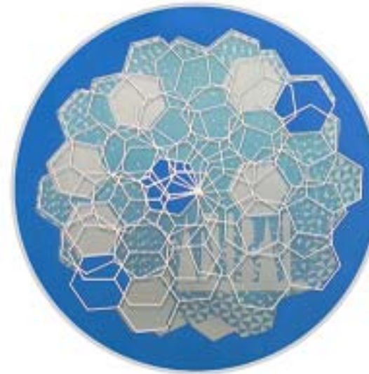
TRANSFER Seripress Booth: 305 GREENLIGHT DM154-4N