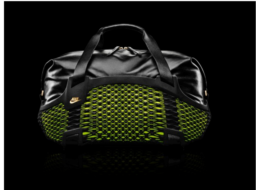
Nike Bag for World Cup