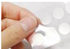
Antibacterial Trouble Patch