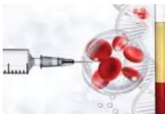
Blood plasma Filter