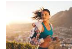
Sport · Outdoor