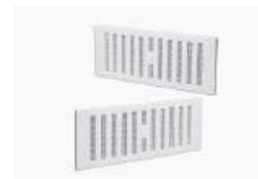
Air Pressure Vent