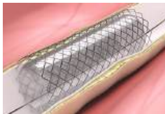
Artificial Blood Vessel